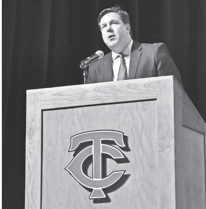
TCHS Athletics Award Ceremony